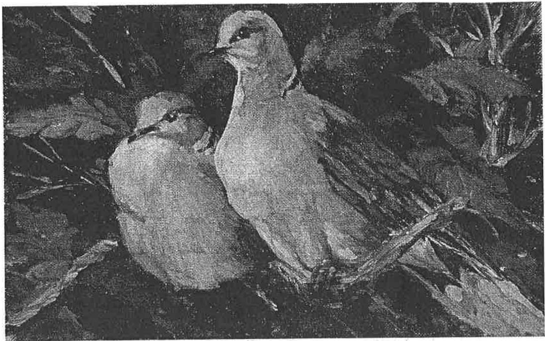
Ring Doves (1998) by Rosemary Lowndes (1937–2001).

The next day, when the festival began anew, and the parents and stepsisters had gone to it, Aschenputtel went to the hazel bush and cried,