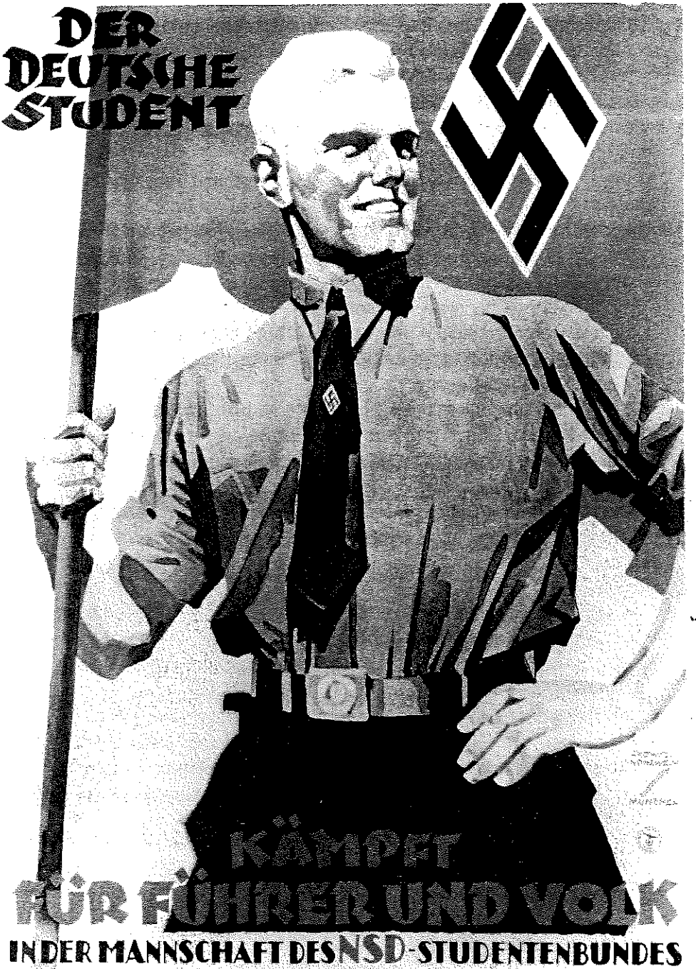
Recruiting poster for Hitler's National Student Organization. Translation at top left: "The German Student"; at bottom: "Fight for your leader and the people."