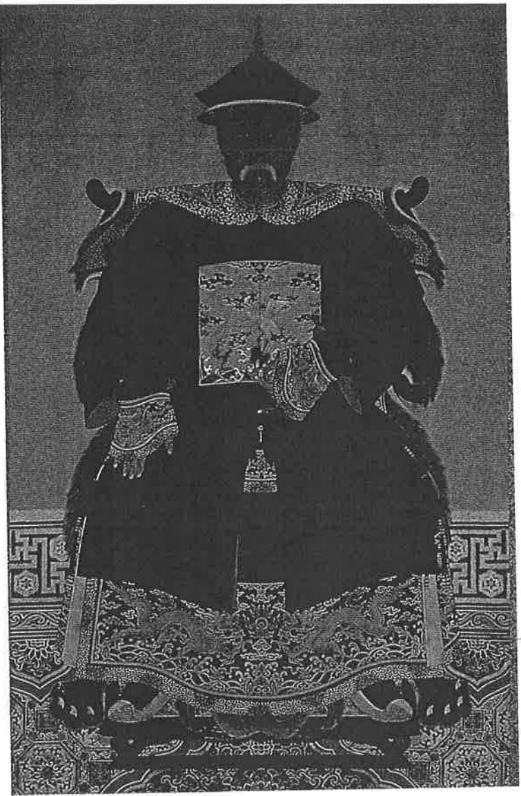
Ancestor Portrait (late 17th or early 18th century) by Chinese School. Private collection.