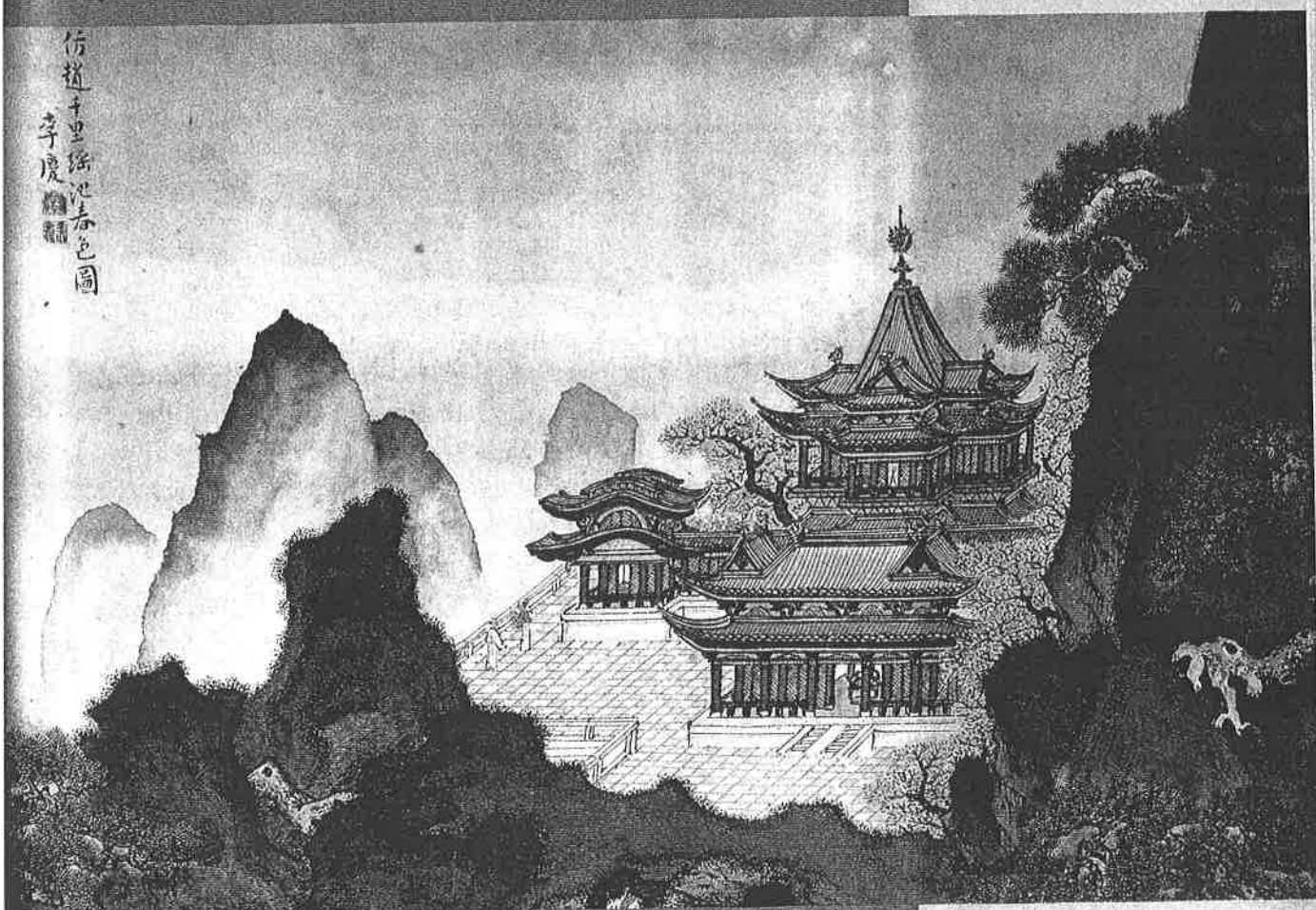
Blue and Green Landscapes by Li Qing